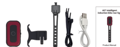
Bike rear light Seat Bracket Seat post bracket Cable ties Charging wire Product Manual