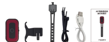
自行车尾灯 座垫支架 座杆支架 扎带 USB数据线 说明书