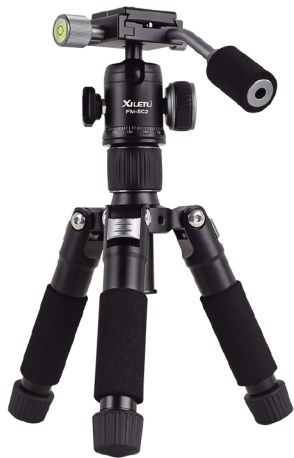
FM5C2 Travel Tripod