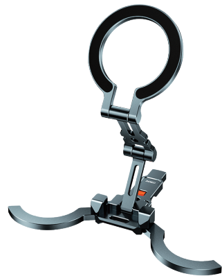
XJ-30 Magnetic support bracket